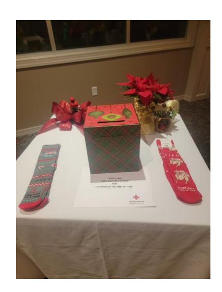
Thank you all for your contributions to the American Red Cross for hurricane relief.